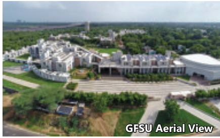
GFSU Aerial View