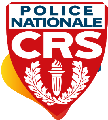
Trainings by French Police CRS

PCPS was established through international support as a first phase. Some other important facilities were postponed to the second phase. However, a set of international training programmes by international actors is taken place, including workshops, and training courses