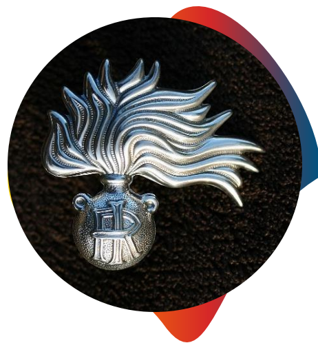
Trainings by Carabinieri