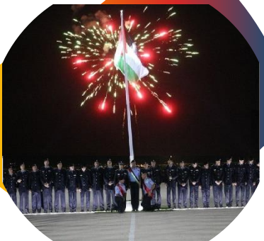
Ceremonies & Events

Extracurricular work is a cornerstone of PCPS's culture, through hosting various police events represented by meetings, workshops national festive events; as well as hosting police personnel before and after their travel abroad to attend military programmes and colleges, camps and trainings courses. The PCPS also hosts scientific conferences, meetings with international actors, and specialized police workshops.