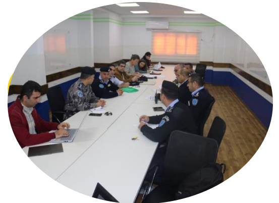
Scientific Conferences & Workshops