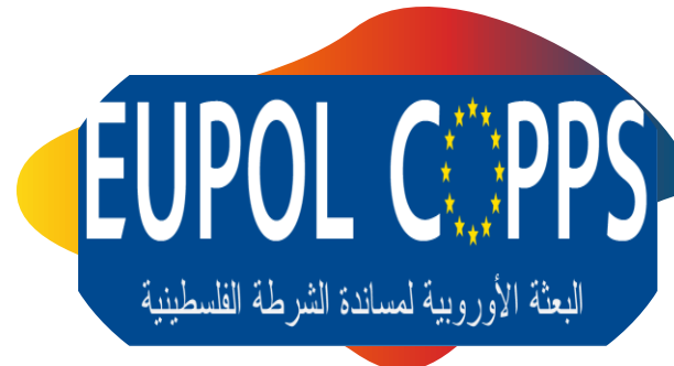
Workshops & trainings by EUPOLCOPPS